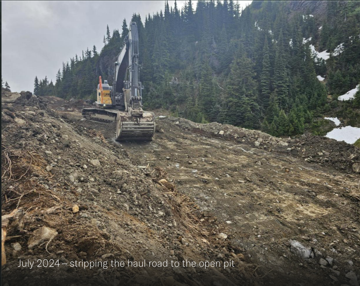
July 2024 – stripping the haul road to the open pit