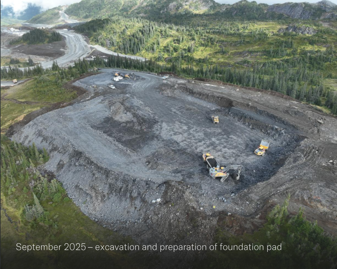
September 2025 – excavation and preparation of foundation pad