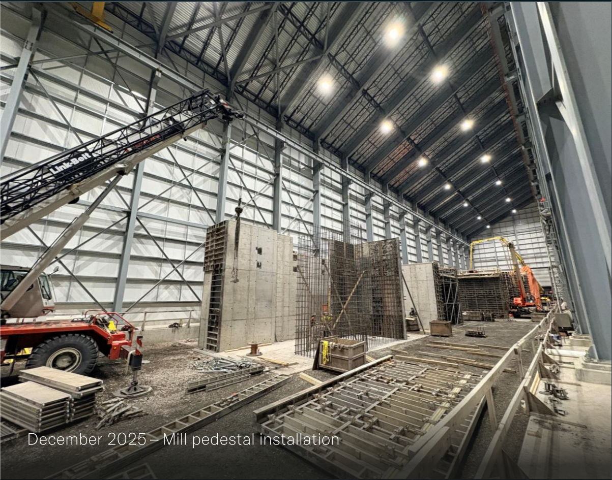
December 2025 – Mill pedestal installation