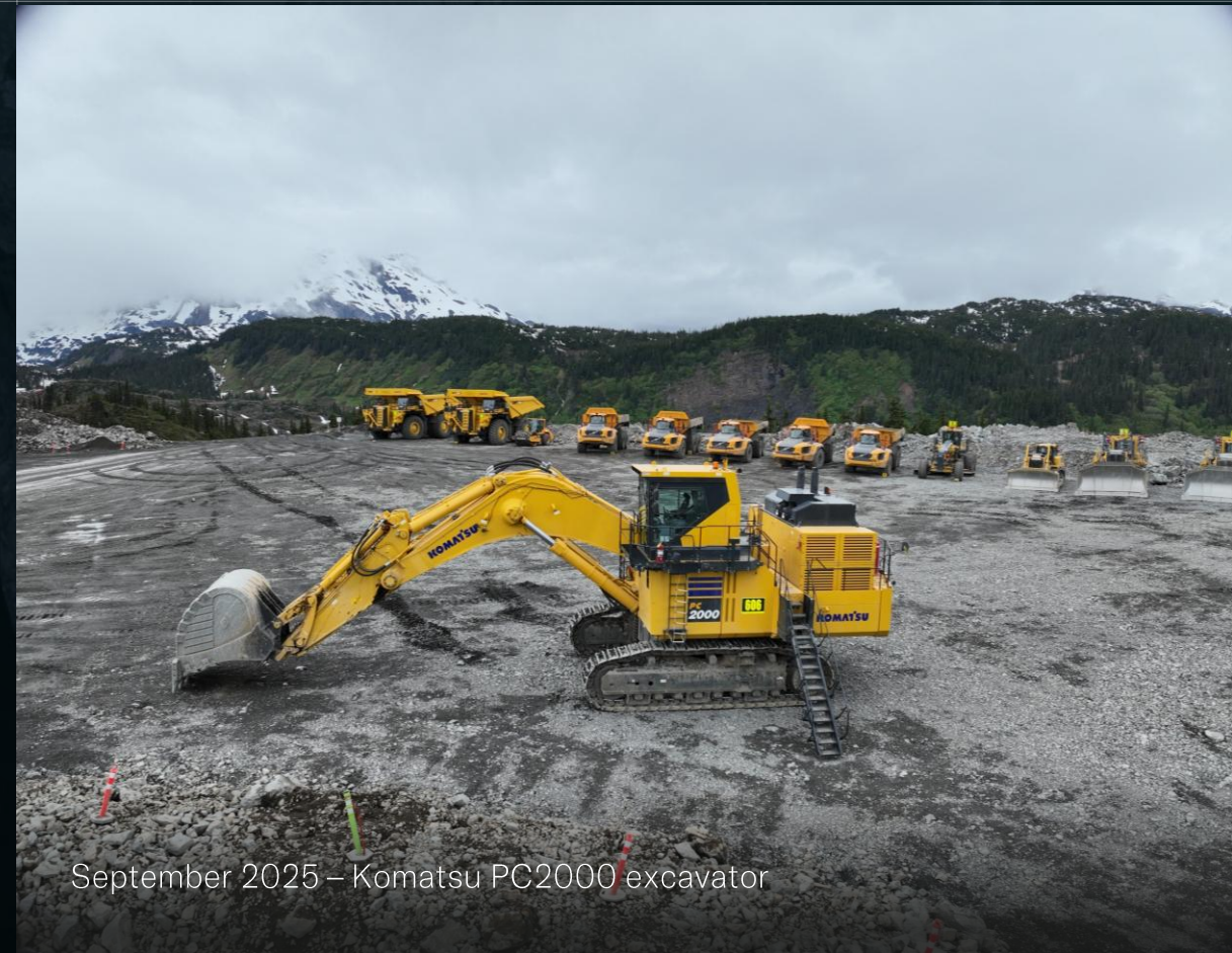
September 2025 – Komatsu PC2000 excavator