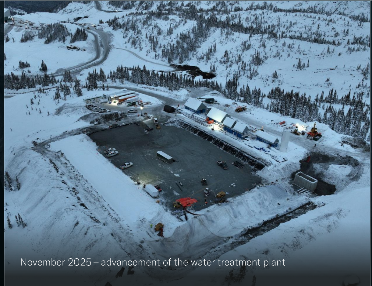
November 2025 – advancement of the water treatment plant