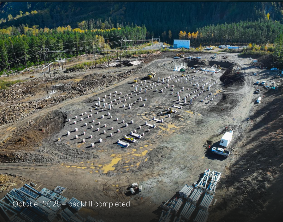
October 2025 – backfill completed