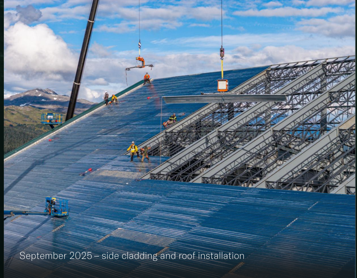
September 2025 – side cladding and roof installation