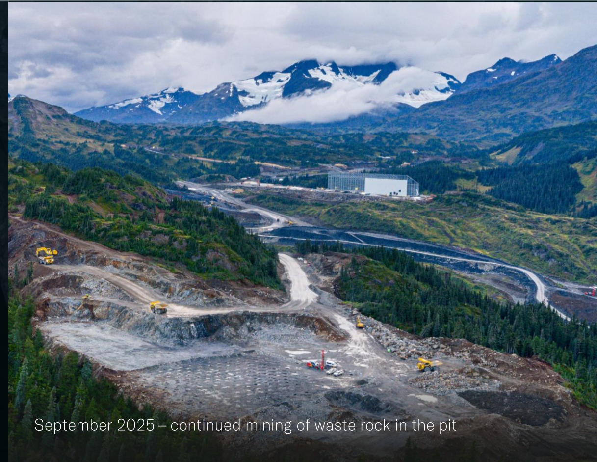
September 2025 – continued mining of waste rock in the pit