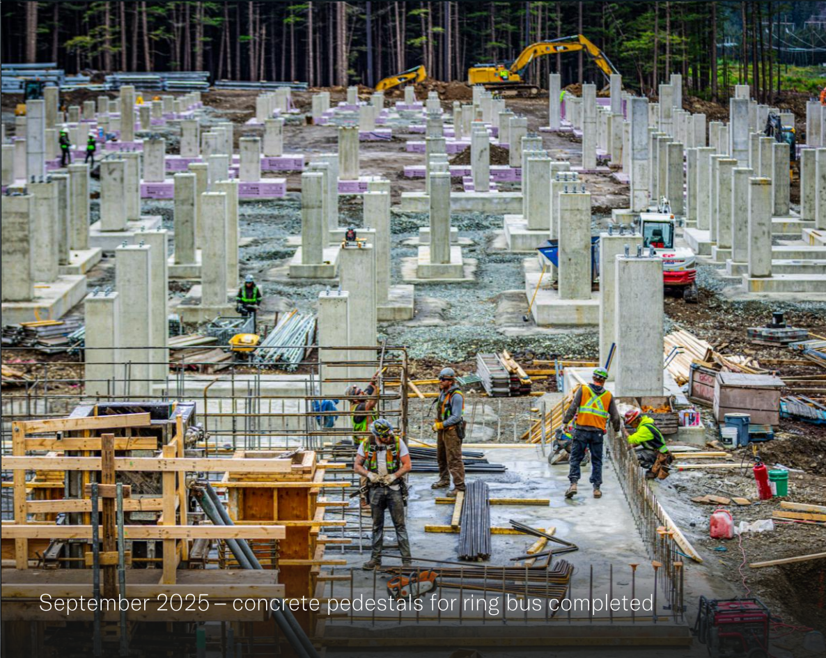
September 2025 – concrete pedestals for ring bus completed