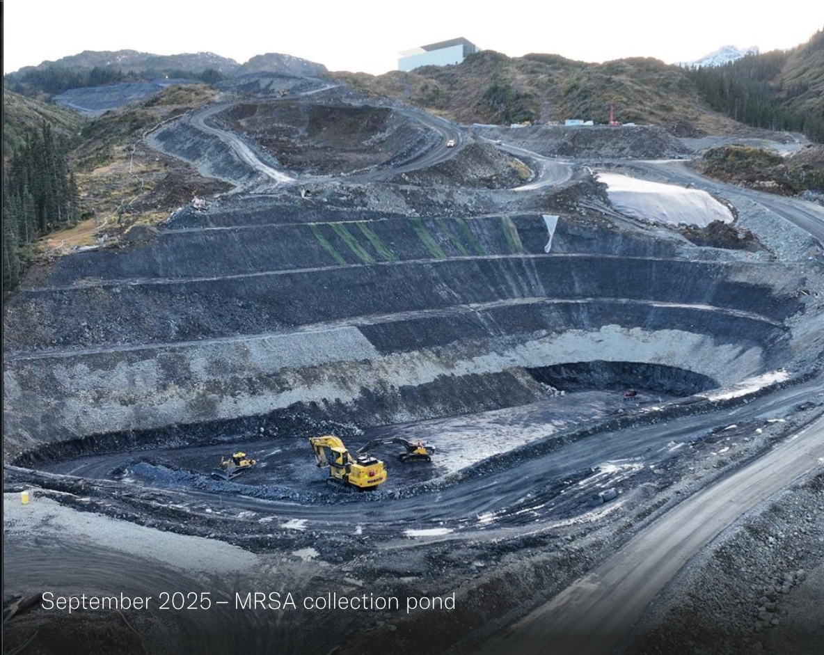
September 2025 – MRSA collection pond