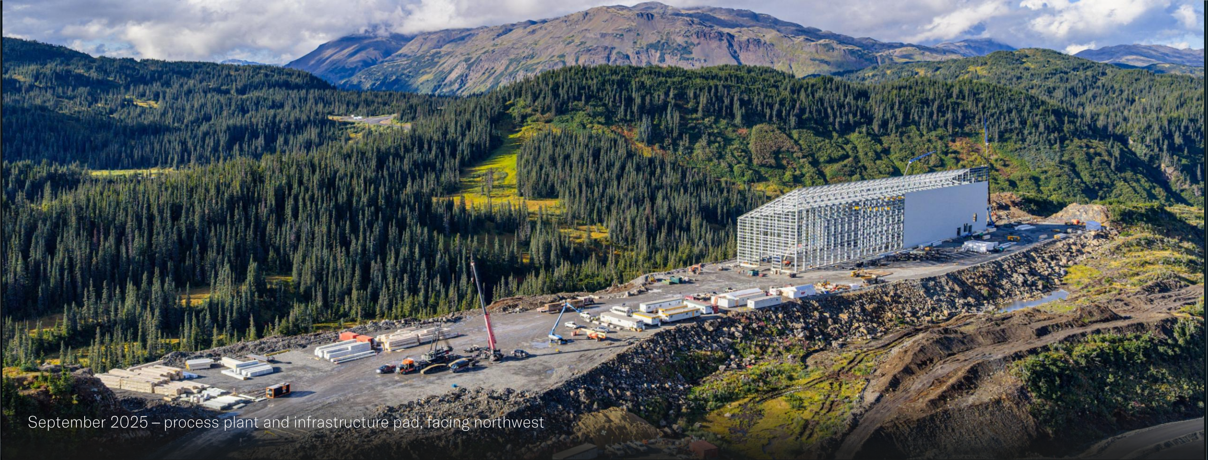
September 2025 – process plant and infrastructure pad, facing northwest

Steel was erected by September 2025, and the process plant was ready for cladding installation ahead of winter