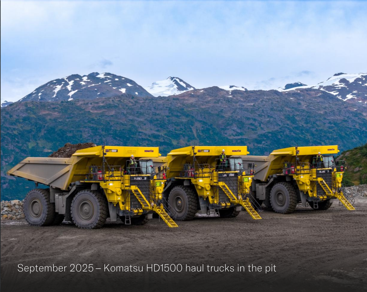
September 2025 – Komatsu HD1500 haul trucks in the pit