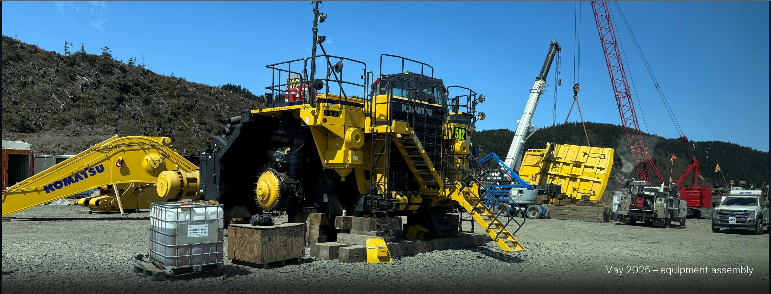
May 2025 – equipment assembly