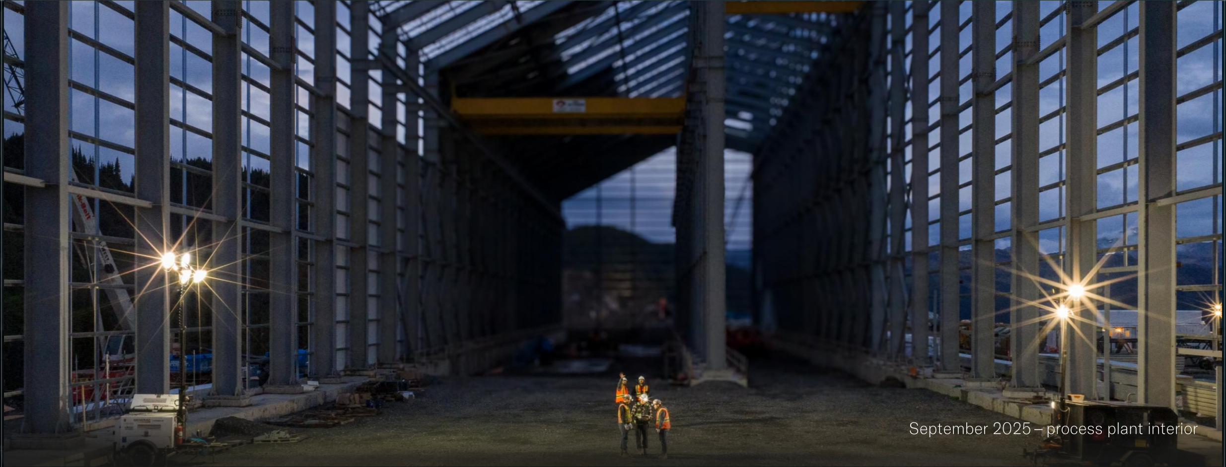
September 2025 – process plant interior