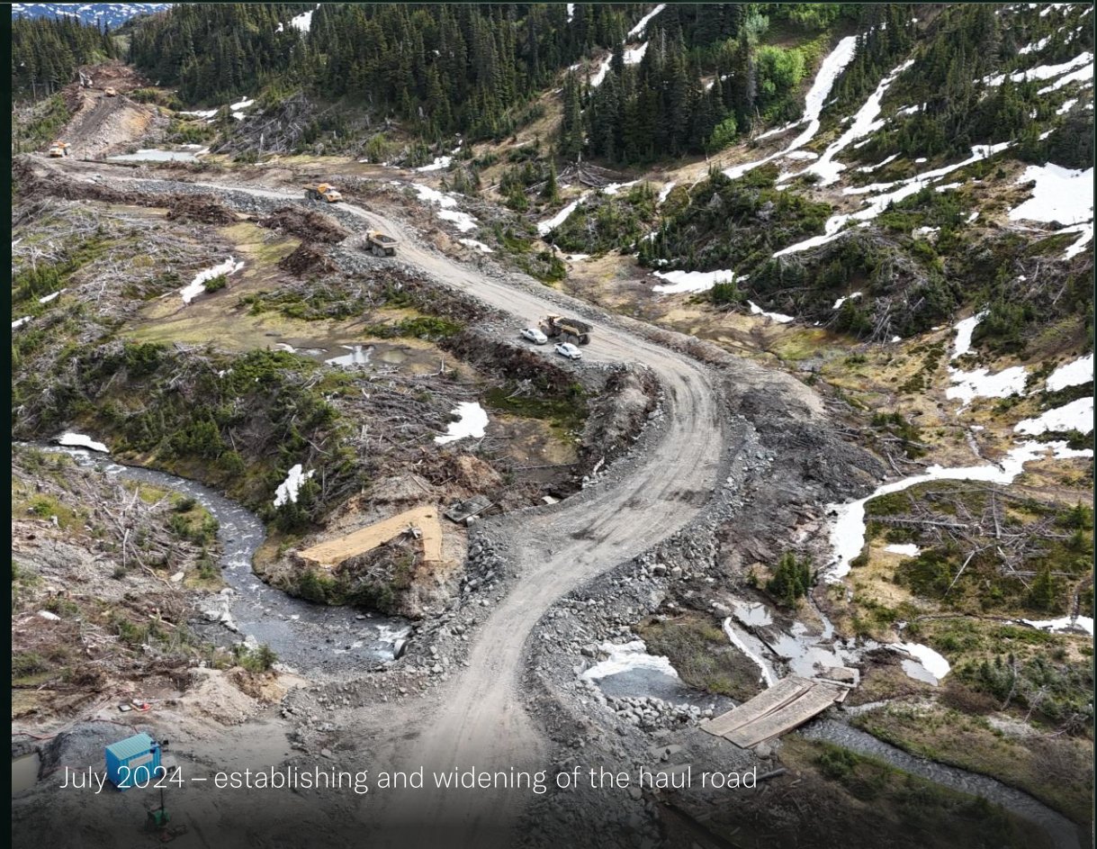
July 2024 – establishing and widening of the haul road