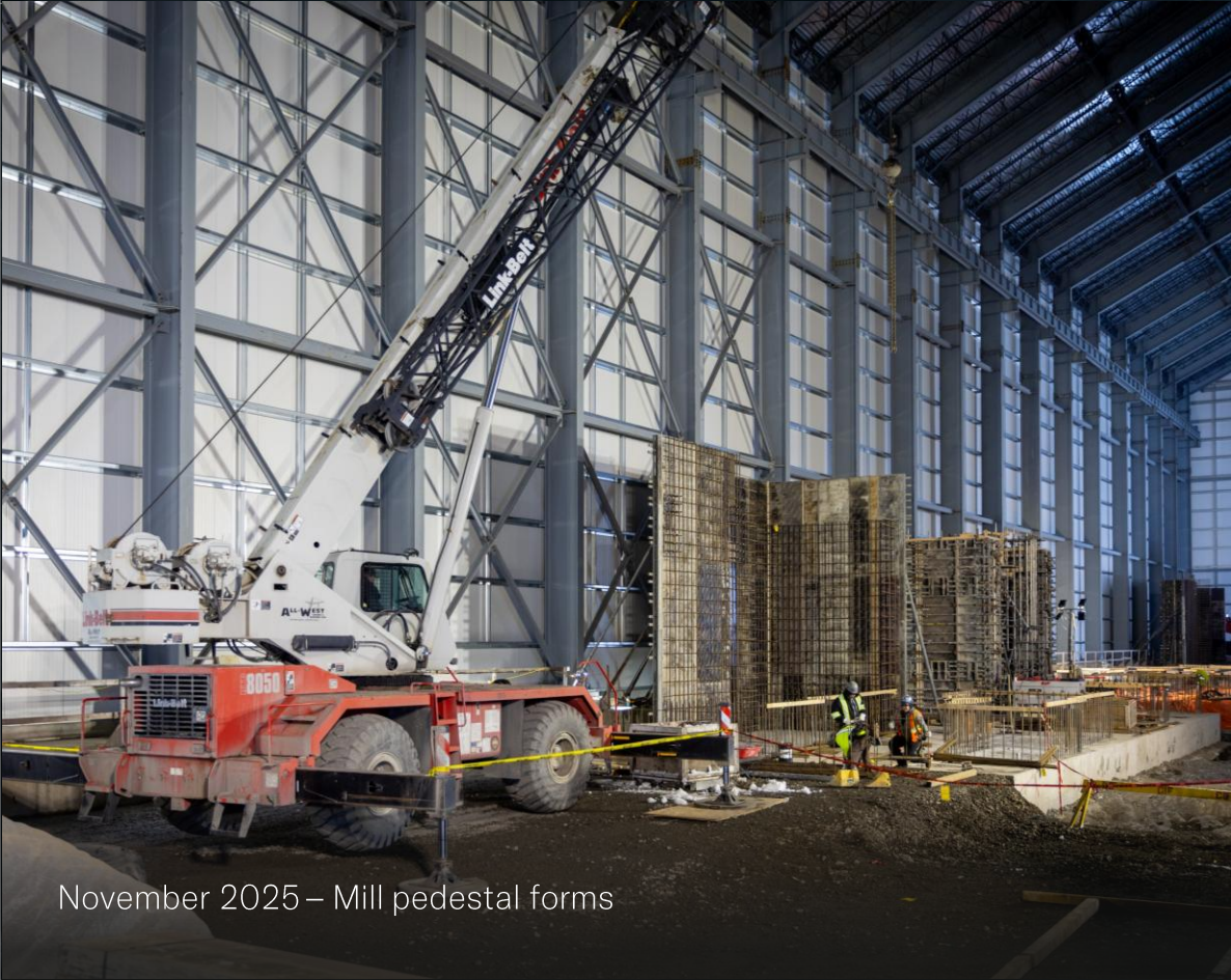
November 2025 – Mill pedestal forms