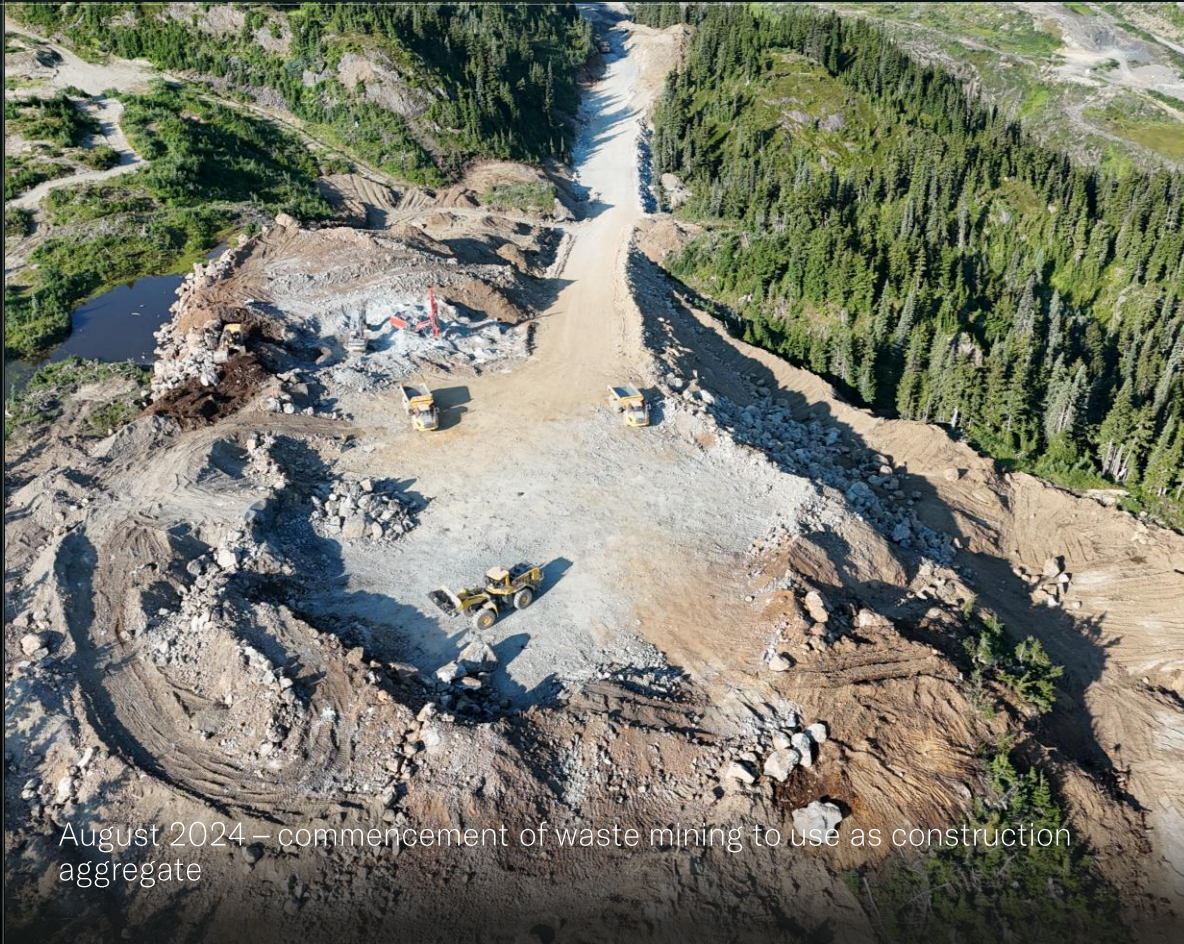
August 2024 – commencement of waste mining to use as construction aggregate