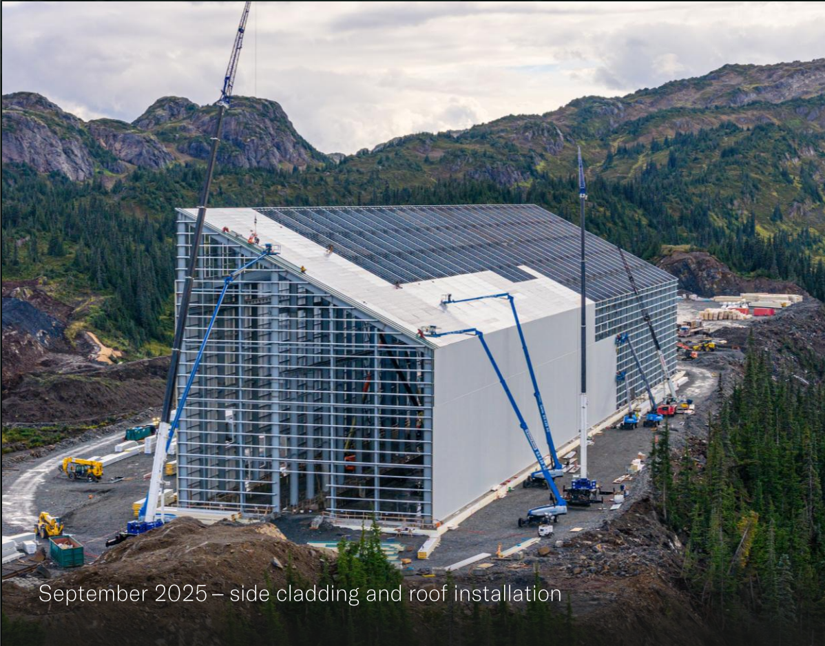
September 2025 – side cladding and roof installation